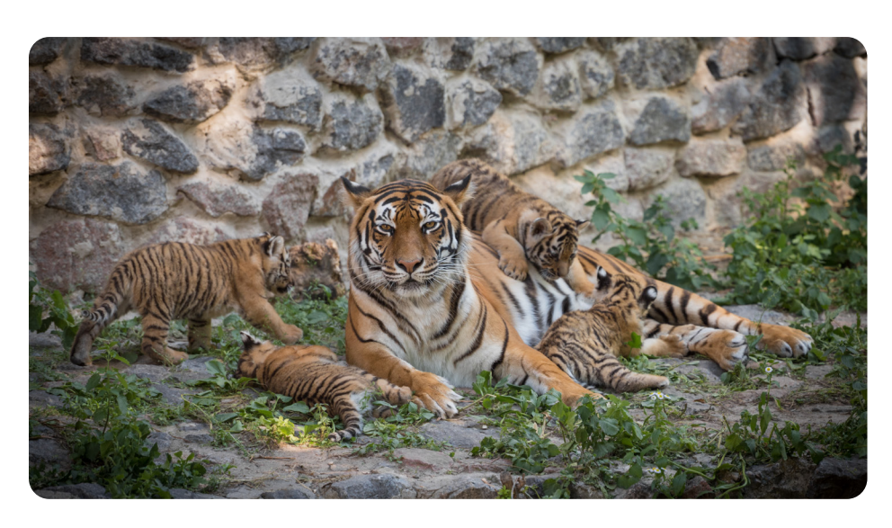
Mammals are animals that breathe air, have warm blood and give birth to live babies.