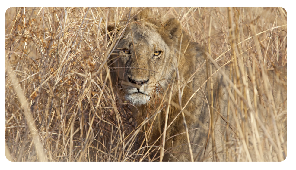
Camouflage is an animal's natural colouring or pattern that helps it blend in with its surroundings.