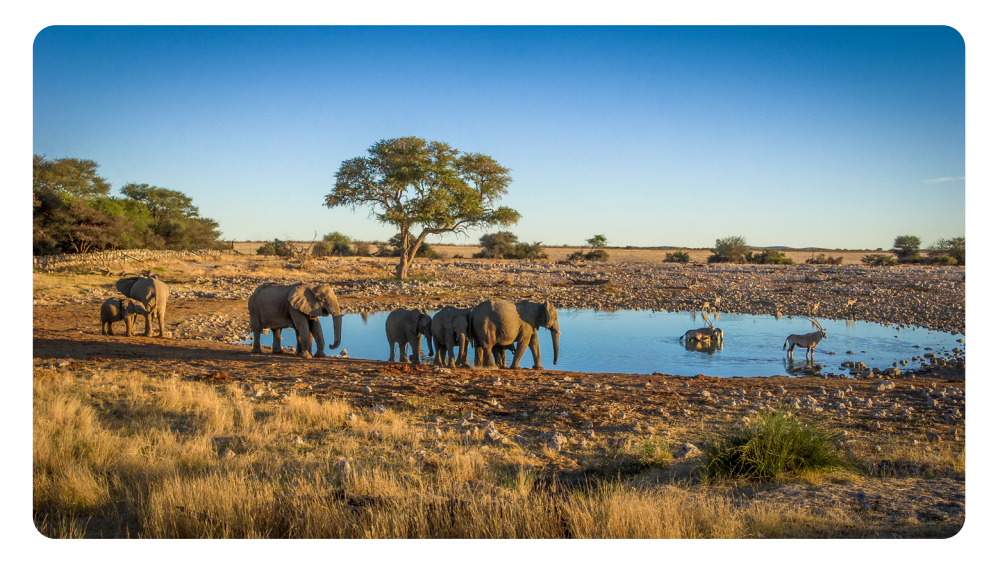
A habitat is a natural home for plants and animals. Animals need food, water and shelter to survive in their habitat.