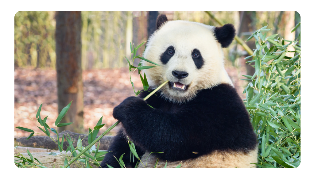
Carnivores eat other animals. Herbivores eat plants. Omnivores eat plants and other animals.

Read these interesting facts about animals with a parent, carer or teacher.