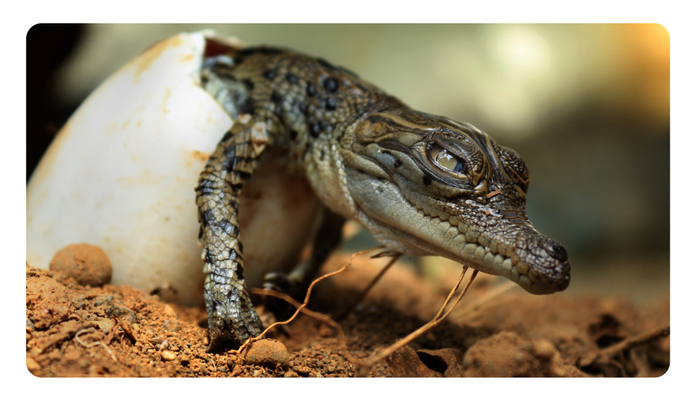
Reptiles are animals that breathe air, have dry, scaly skin and lay eggs.